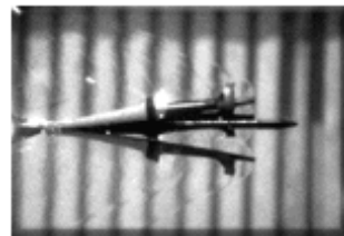
Missile: 100 mm projectile Sabot separation at 10 meters downrange from gun muzzle, velocity 1600 m/sec @ 2 \mu sec gate.

The COOKEScope Model 125 requires little maintenance or care during its operation, and no special precautions are needed for storage of the system.